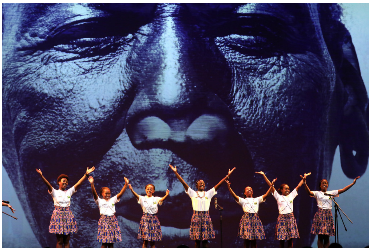
Closing ceremony at the World Humanitarian Summit

Jump to: Latest News | Recent Developments | IASC Priorities | IASC Events | Reports and Studies Featured Product | Upcoming Events