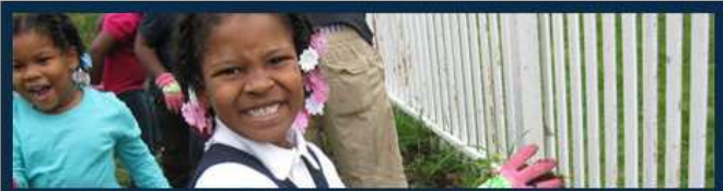
Helping kids and residents make healthy choices!

Established in 2003 by neighborhood residents, the East Park Revitalization Alliance (EPRA) seeks to build a healthy community in the Strawberry Mansion neighborhood, focusing on environmental improvement and health promotion. We turn vacant land into community gardens, operate programming to connect neighborhood residents to the adjacent park, and planted over 700 trees in the community and run the "Healthy Choices" Youth Program, an after-school and summer program for neighborhood youth ages 6-18 at our local recreation center that is based on giving youth the skills to make the healthy choices that will help them become healthy adults.