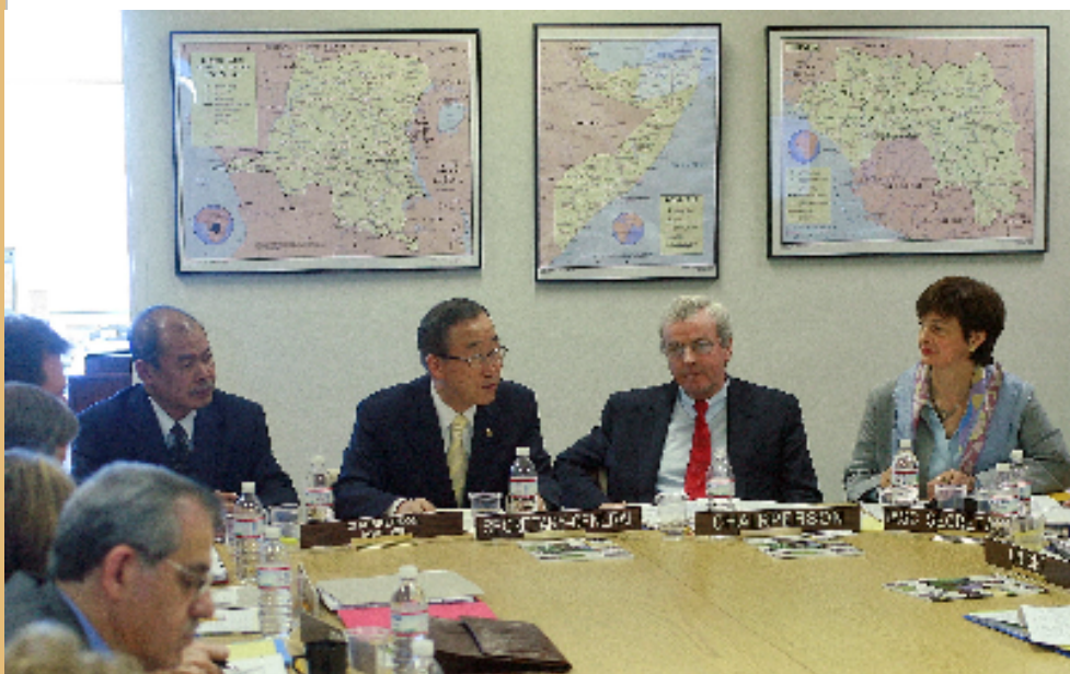
United Nations Secretary-General Ban Ki-moon addresses the IASC Principals

THE IASC SUBSIDIARY BODIES assist in developing policy and operational guidelines and include: (i) Sub-Working Groups and Contact Groups, with unlimited duration, dedicated to long and medium-term policy issues; (ii) time limited Task Forces, with specific mandates, including facilitating inter-agency coordination and providing guidance for large-scale emergencies; and (iii) Reference Groups, which play an advisory role to the Working Group and may also work to produce IASC products.