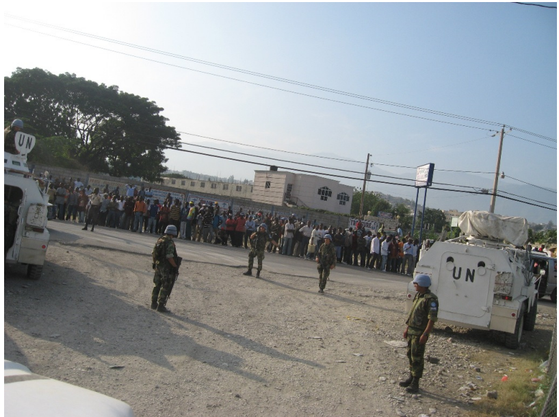
Security forces outside USAR BoO.

Port-au-Prince was already before the earthquake divided in green and red zone (areas which would require armed escorts). Mainly the harbour area, from Cité Soleil towards the south and Carrefour, was considered a red area where military escort was necessary. This had a huge impact on the USAR operations, as there was insufficient capacity in UNPOL and MINUSTAH to facilitate the required deployments in the red zones.