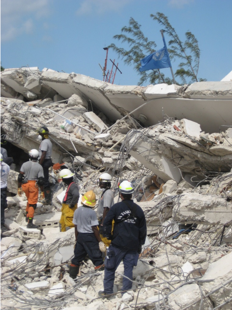
USAR team at Hotel Christopher, the former UN Headquarters in Port-au-Prince.

United Nations Disaster Assessment & Coordination (UNDAC)