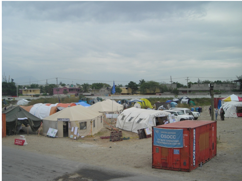
OSOCC in Port-au-Prince.

Due to the fact that many of international USAR teams as well as humanitarian organizations were flying to Port-au-Prince via Santo Domingo, Dominican Republic, a second RDC was established at the international airport of Santo Domingo under the leadership of the UNDAC team which was deployed to Dominican Republic following a request from the UN Resident Coordinator in the Dominican Republic. This RDC was staffed by one UNDAC support staff from IHP. The function of this RDC was to ensure that the information regarding teams waiting in Santo Domingo was communicated to the RDC in Port-au-Prince and the necessary actions to support the teams were provided. Some of the teams benefited from the RDC in Santa Domingo to coordinate their arrival to Port-au-Prince whereas other teams preferred to go by road.