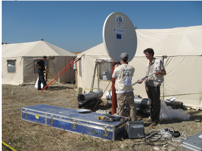
TSF working on VSAT outside the main OSOCC.

Even where the technology failed in the face of the harsh conditions and circumstances, the same cannot be said of the staff and users. Even in the harshest conditions, the UNDAC Support Team remained cheerful, hard working and dedicated to the success of the mission. As a consequence, there were no massive ICT failures that halted operations. Other than the Internet connection, everyone was always able to work, even though at times the Wireless LAN was slow. Every failure was addressed within minutes of it being noticed and the ICT support process generally functioned smoothly. Furthermore has the Support Team appraised UNDAC and OCHA staff as easy customers. At no time was there any impatience or lasting anger directed to any ICT support staff in spite of the difficult conditions. This contributed to the smooth running of the ICT support functions.