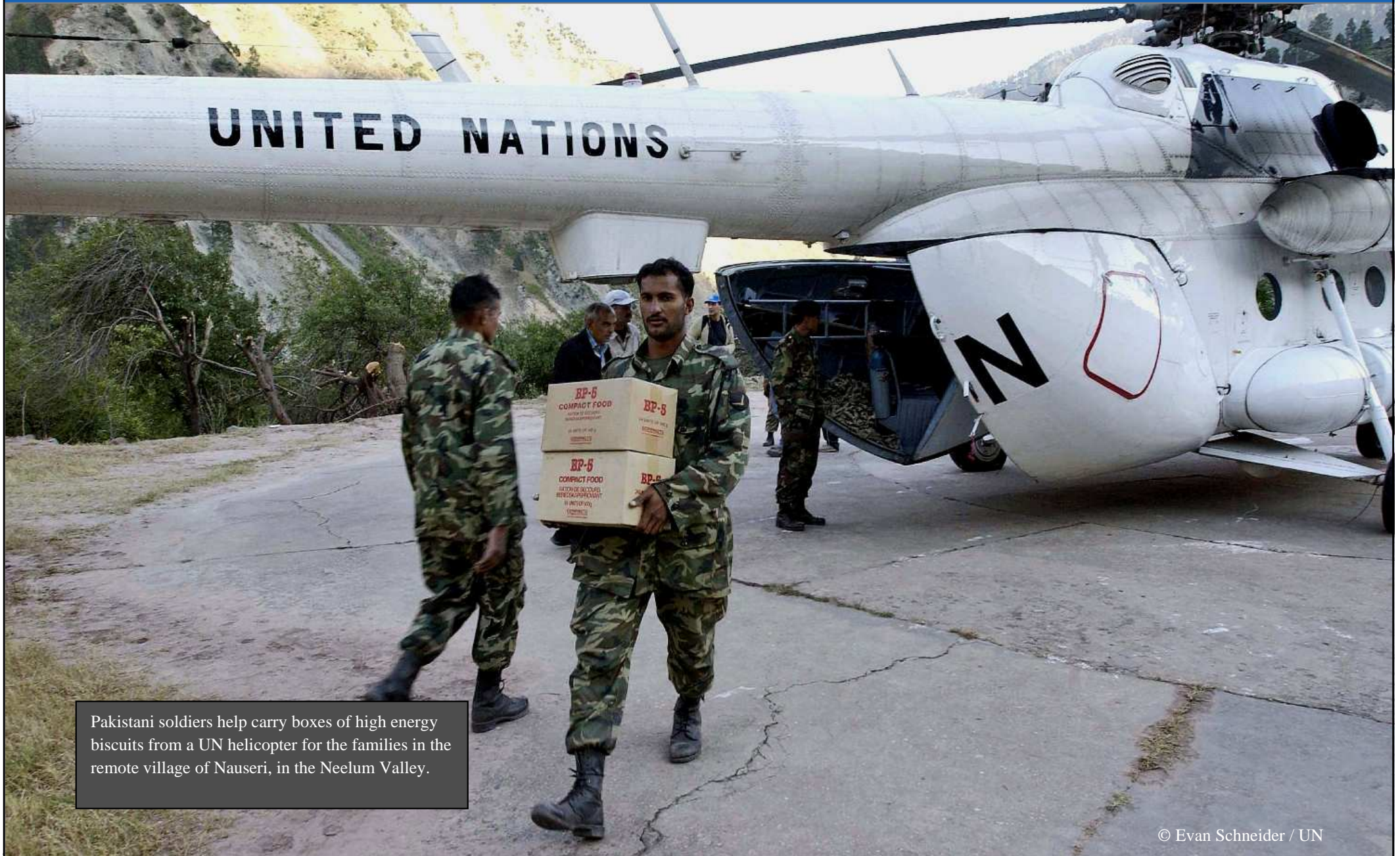
Pakistani soldiers help carry boxes of high energy biscuits from a UN helicopter for the families in the remote village of Nauseri, in the Neelum Valley.