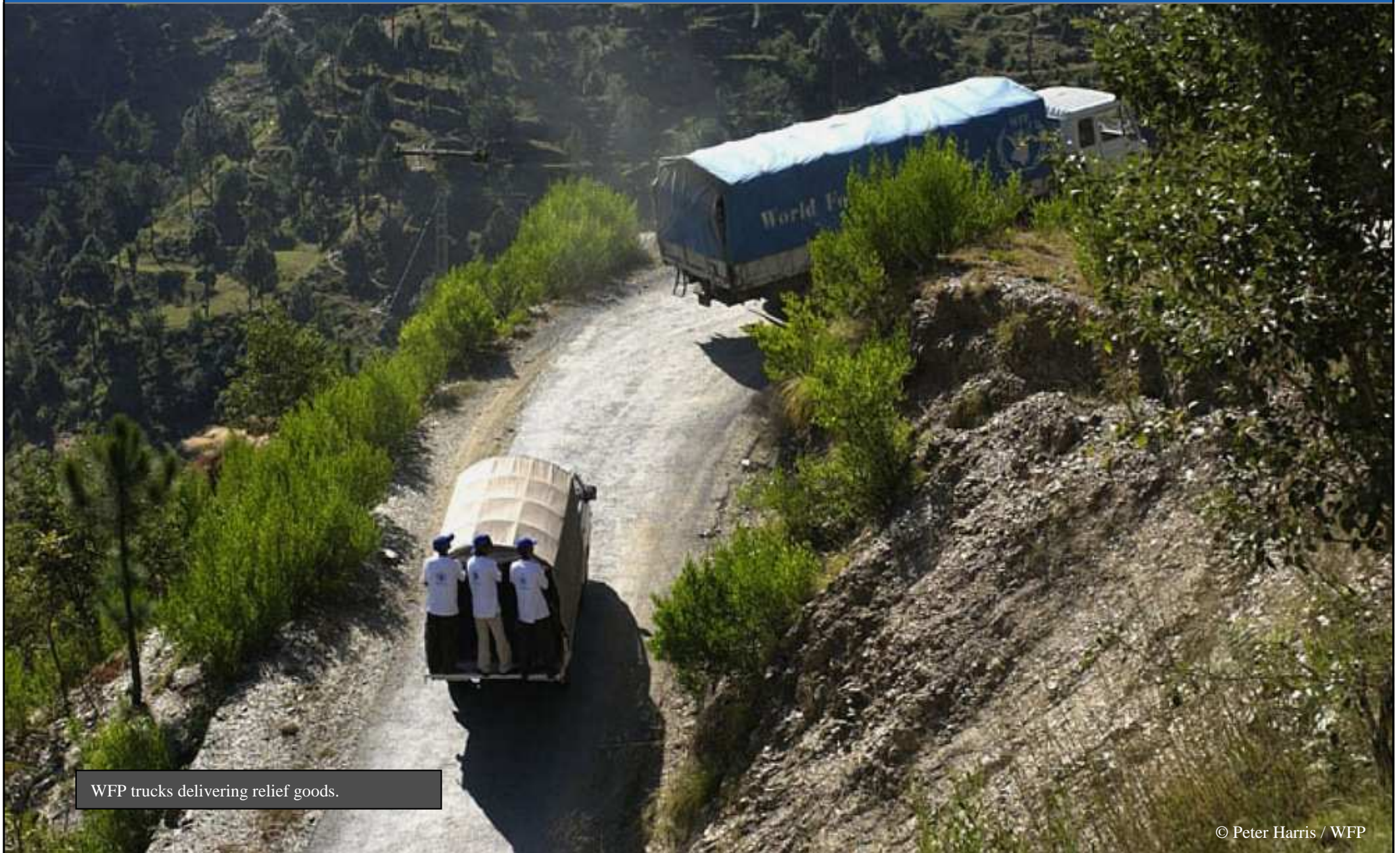
WFP trucks delivering relief goods.