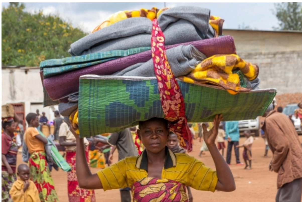
A Burundi mother flees into Rwanda to escape violence.

Welcome to the May 2015 issue of IASC News .