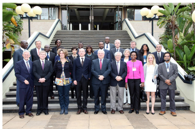
IASC Principals meeting in Nairobi.