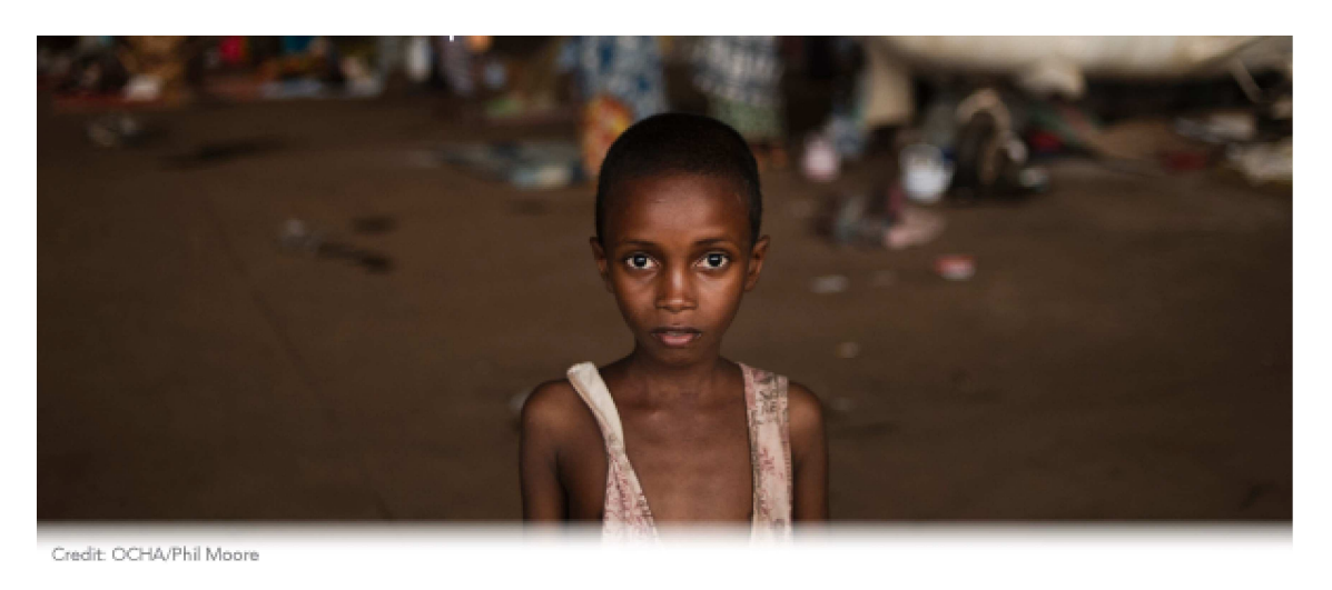
A displaced child stands in an aircraft hanger where violence has largely split communities along religious lines, displacing tens of thousands in the Central African Republic.

Welcome to the first issue of IASC News, which aims to inform you about developments in the IASC community. Developed by the IASC secretariat, the News aims to provide a general overview of events and meetings of interest to you. This first version covers news from the last few months. In future we aim for IASC News to be a monthly feature. We welcome your feedback and input to <a href="mailto:iasccorrespondence@un.org">iasccorrespondence@un.org</a>.