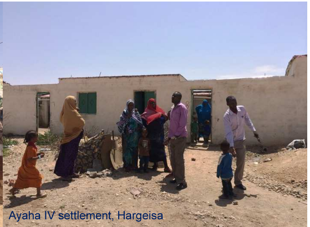
Ayaha IV settlement, Hargeisa