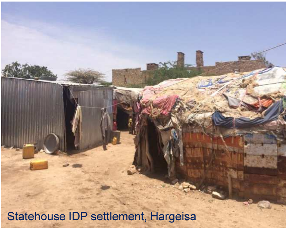
Statehouse IDP settlement, Hargeisa