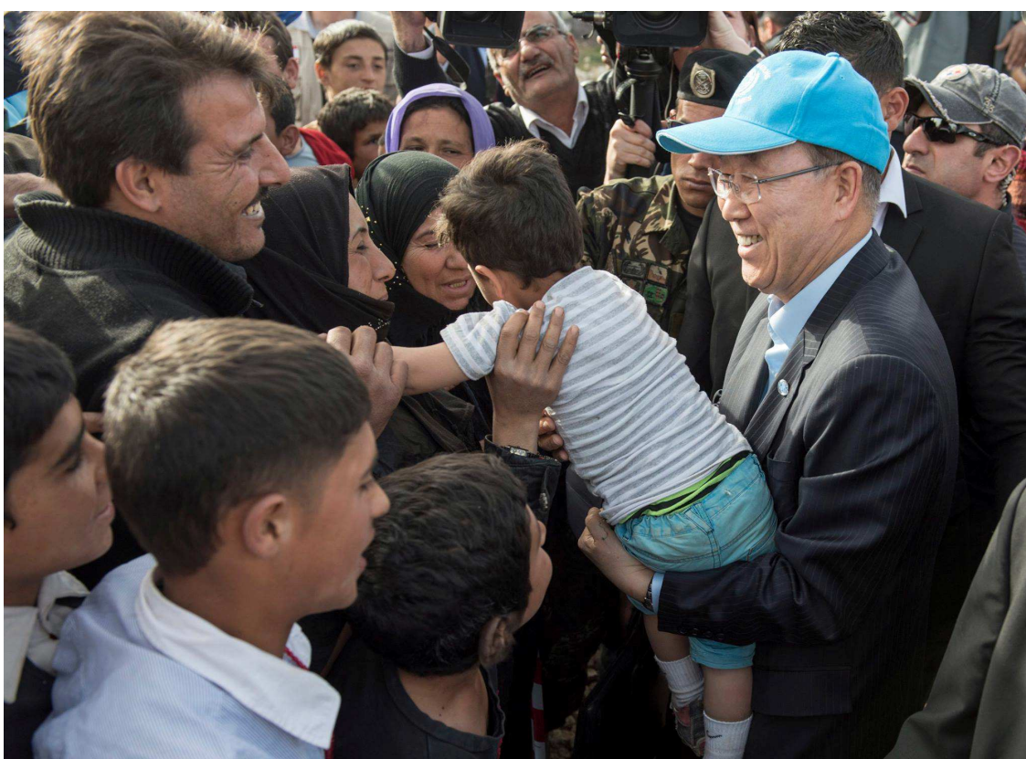
Secretary-General Ban Ki-moon holding a child while speaking to refugees in Beqaa Valley, Lebanon.