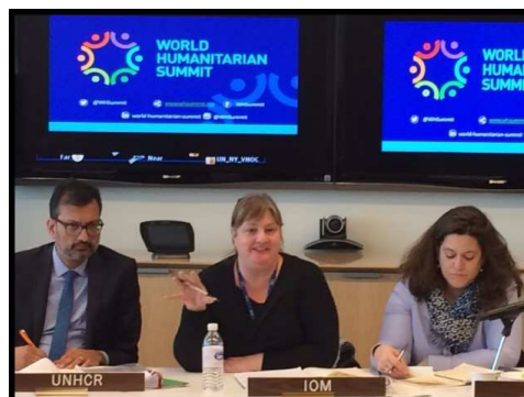
Members of the IASC Working Group engage during the session on the World Humanitarian Summit.