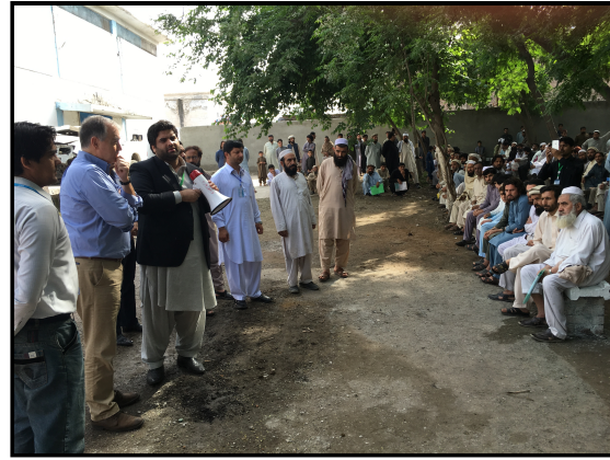
STAIT mission to Pakistan