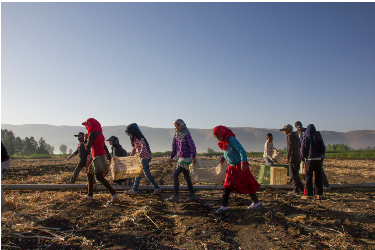
Report cover "Slavery and exploitation of Syrian refugees in Lebanon"

Jump to: Latest News | Recent Developments | IASC Priorities | IASC Events | Reports and Studies Featured Product | Upcoming Events