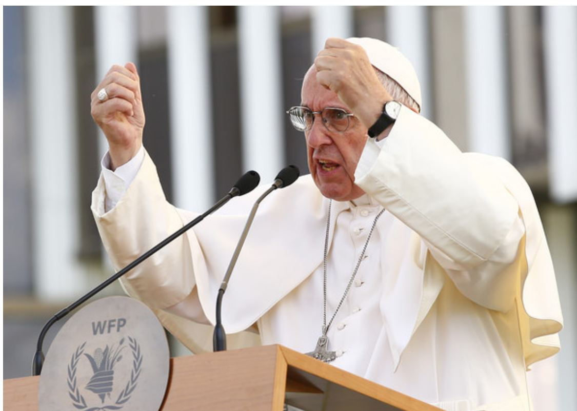
Pope Francis gathers critical momentum for hunger when visiting WFP's Executive Annual Session early June.

With apologies for the slight delay due to technical challenges