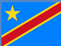
Democratic Republic of Congo, North Kivu