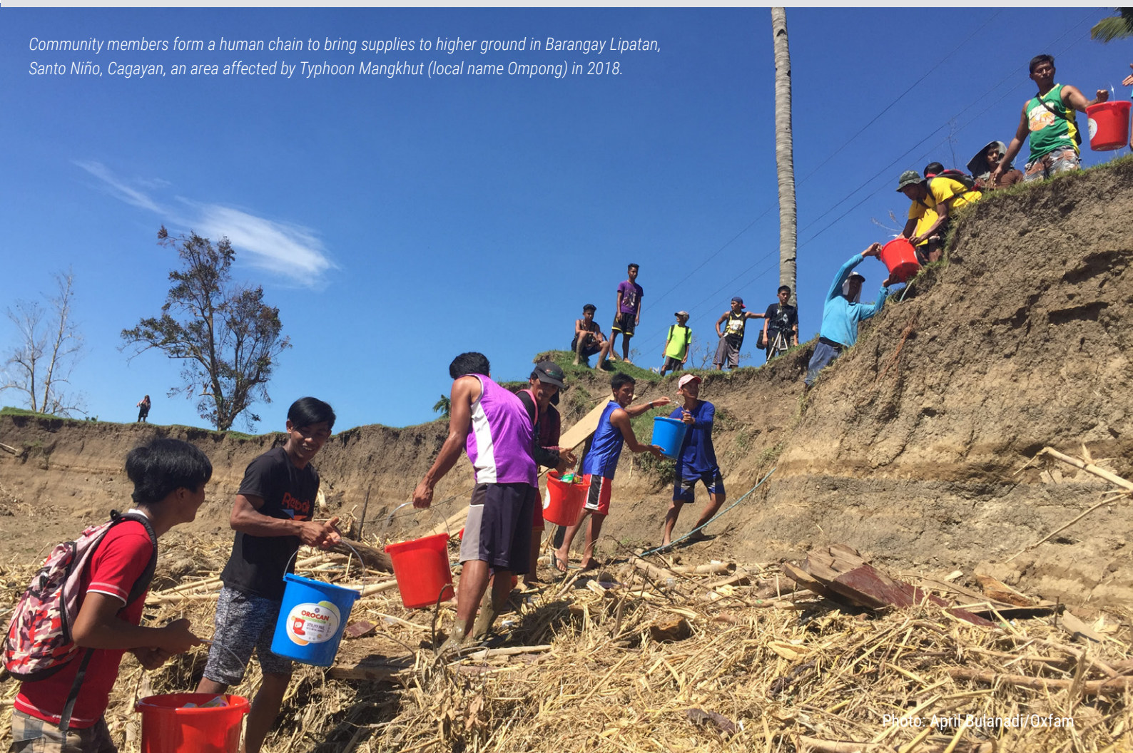
Community members form a human chain to bring supplies to higher ground in Barangay Lipatan, Santo Niño, Cagayan, an area affected by Typhoon Mangkhut (local name Ompong) in 2018.