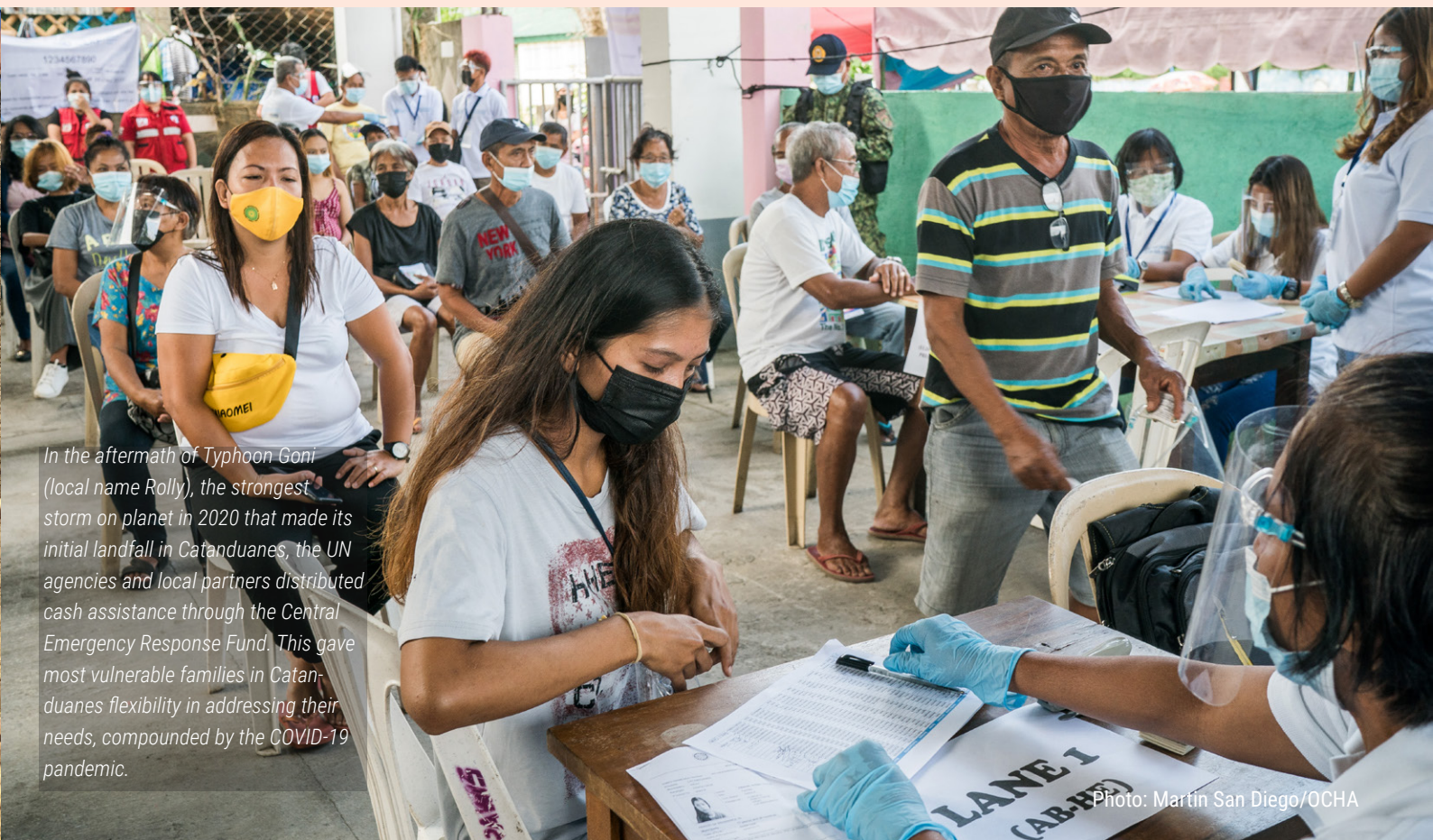
In the aftermath of Typhoon Goni (local name Rolly), the strongest storm on planet in 2020 that made its initial landfall in Catanduanes, the UN agencies and local partners distributed cash assistance through the Central Emergency Response Fund. This gave most vulnerable families in Catanduanes flexibility in addressing their needs, compounded by the COVID-19 pandemic.