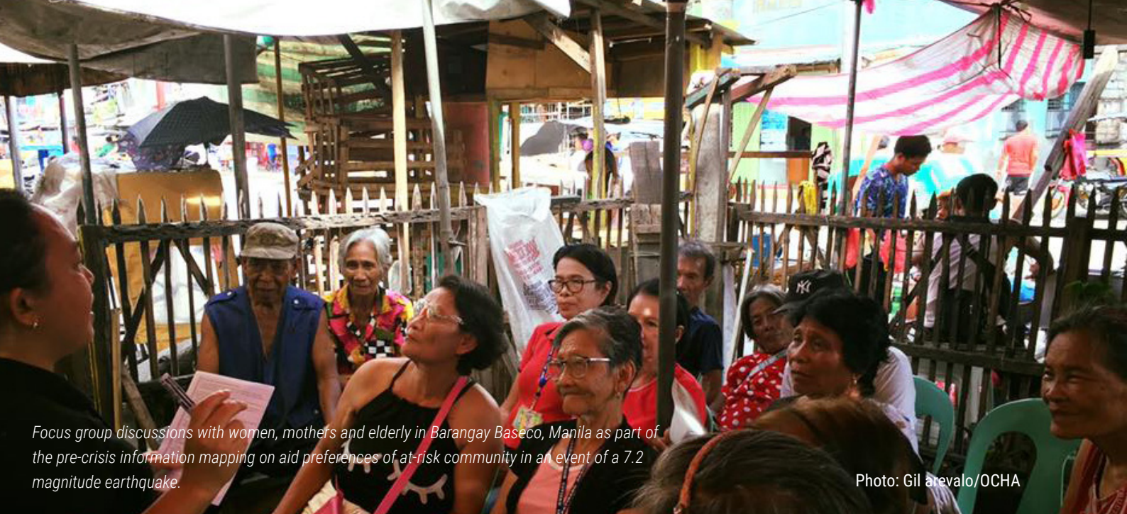
Focus group discussions with women, mothers and elderly in Barangay Baseco, Manila as part of the pre-crisis information mapping on aid preferences of at-risk community in an event of a 7.2 magnitude earthquake.