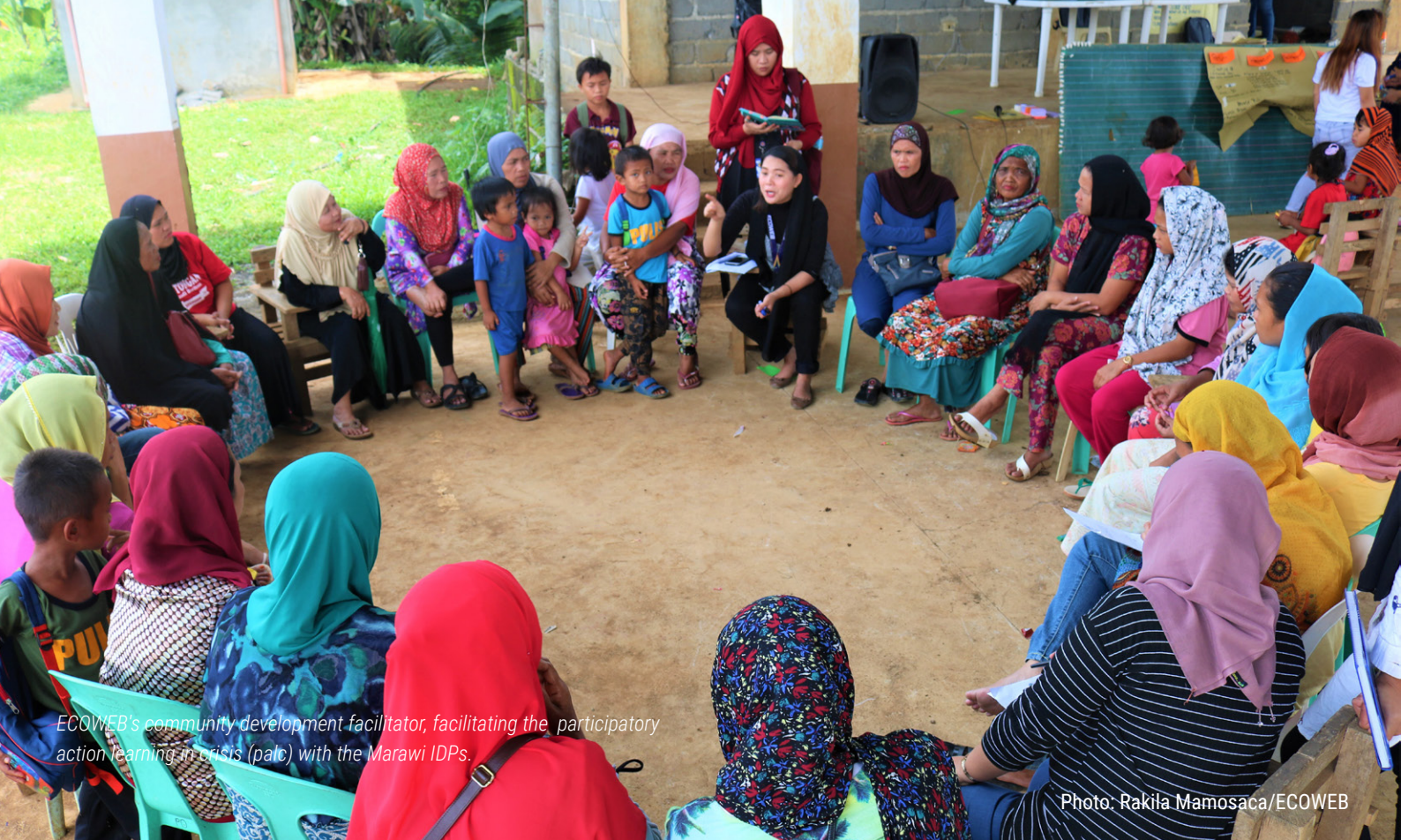
ECOWEB's community development facilitator, facilitating the participatory action learning in crisis (palc) with the Marawi IDPs.