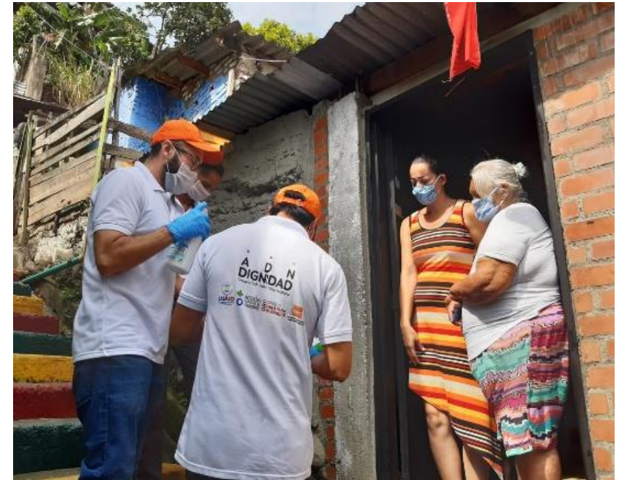
CUA Consortium: April 2020, door-to-door enrolment, Cali