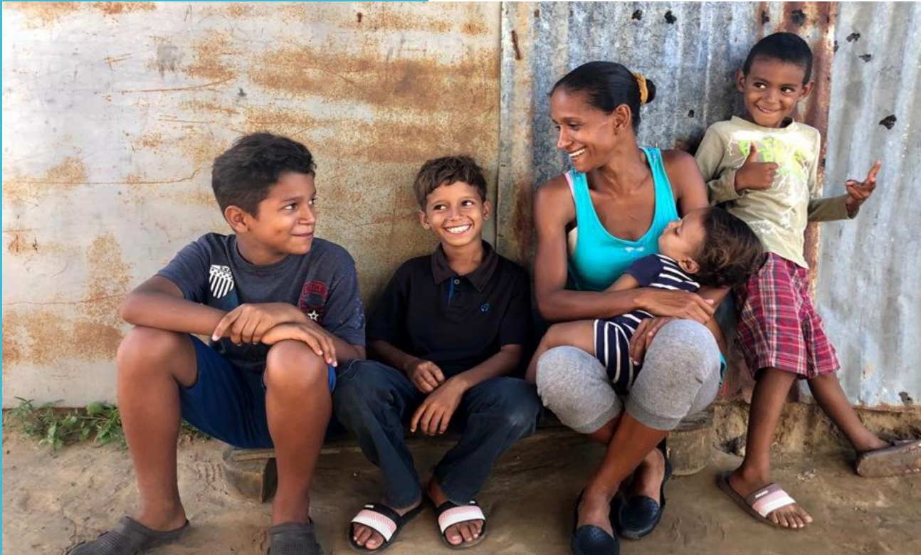
Meaningful Dialogue with Initiative, CashCap (November 2019)