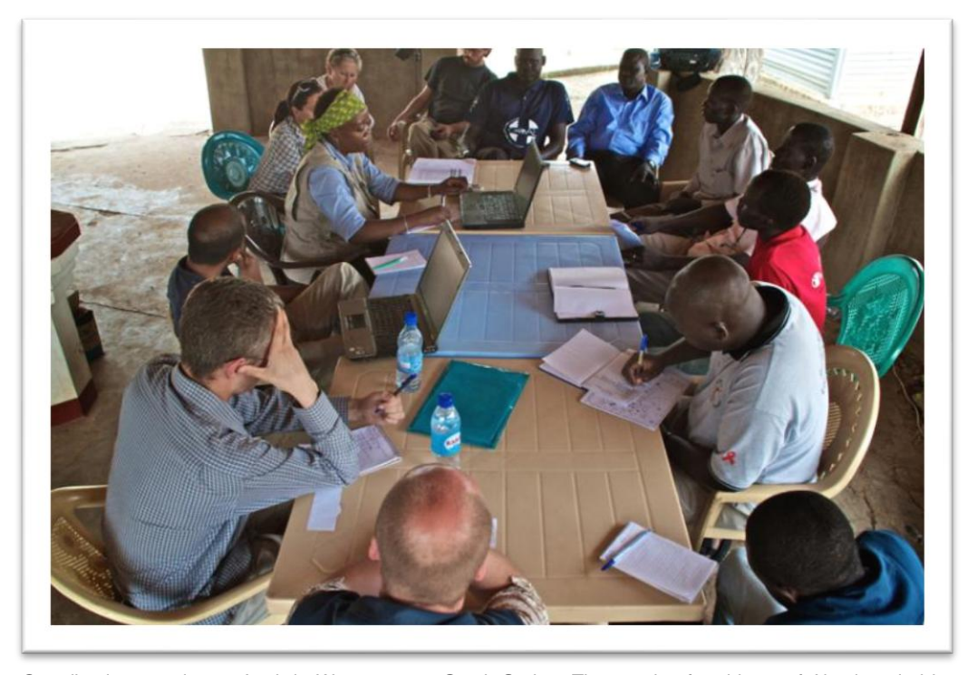
Coordination meeting at Agok in Warrap state, South Sudan. Thousands of residents of Abyei settled in Agok after being displaced by armed clashes in 2011.

The terms of reference of sub-national clusters should follow the core functions of the cluster at the country-level, while at the same time being streamlined and tailored to local operational realities. Accordingly, the working methods of sub-national clusters must be light and focused on service delivery and operational activities; ensuring reporting and information sharing with the national cluster and, through that mechanism, other sub-national clusters; and promoting the involvement of the affected populations in cluster activities to ensure that humanitarian actors respond adequately to their actual needs.