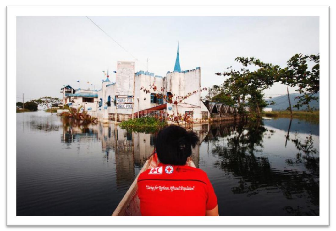
The Philippine National Red Cross distributed blanket and hygiene goods and made a tour to reassess the damages and the condition of the evacuation centers after typhoon Ondoy hit Calamba city in the province of Laguna, Philippines in 2009.

When there are sub-national clusters, each of the hubs should be treated as a separate entity and reported against by the partners locally present in that cluster and the sub-national Cluster Coordinator. This is a separate exercise to that performed by the national cluster as it brings additional detail and insight.