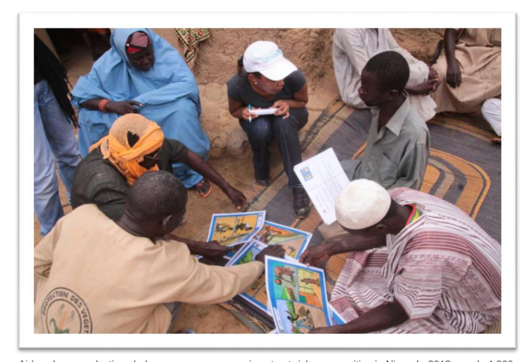
Aid workers conducting cholera awareness campaigns to at-risk communities in Niger. In 2012, nearly 4,000 cholera cases and over 80 deaths have been reported, mostly along the Niger River which recently flooded after heavy rains in the west of the country.

Finally, each cluster is also responsible for integrating early recovery from the outset of the humanitarian response. The RC/HC has the lead responsibility for ensuring early recovery issues are adequately addressed at country level, with the support of an Early Recovery Advisor. The Advisor works on inter-cluster early recovery issues for a more effective mainstreaming of early recovery across the clusters and to ensure that multidisciplinary issues, which cannot be tackled by individual clusters alone, are addressed through an Early Recovery Network<sup>13</sup>. Exceptionally, where early recovery areas are not covered by existing clusters or alternative mechanisms, the RC/HC may recommend a cluster be established in addition to the network to address those specific areas.